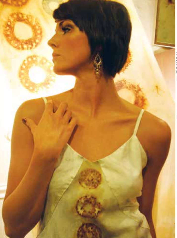
HERE: Rio Wrenn, Demeter Slip: Collection 2009; silk/cotton_rust

"lacefying" effects of rust on metal and is made of hundreds of hand-cut circular motifs, irregular in shape and traced from stones collected from remote Australian beaches. The motifs embed the abstract markings found on the stones. Both "alternative lace" panels are outcomes of Heffer's deliberate deconstructionist manipulations: the circles and strips are reassembled onto a soluble substrate and then free-motion machine stitched; a new lace work emerges as the substrate backing dissolves in water.